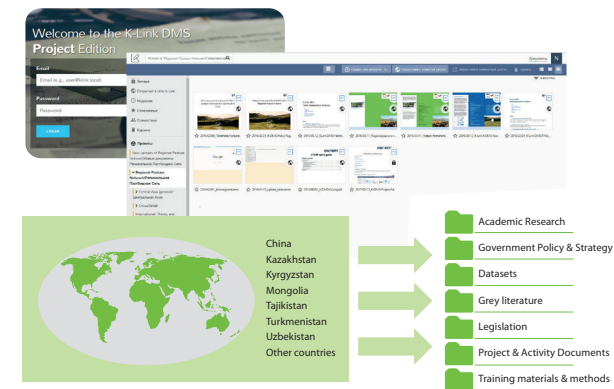
Regional Pasture Network K-DMS Library Collections

At the core of the RPN is an online library. This library stores a variety of materials and documents on pasture-related issues. When you join the network you will be provided with a password to log into the system using your email. The library allows you to search for articles using keywords, and also to list them by country and theme. It also represents an excellent opportunity for you to share documents you would like to disseminate. To do so, simply upload new relevant files or contact RPN Secretariat at rpn@klink.asia .